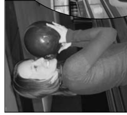
Bowling with the collegians