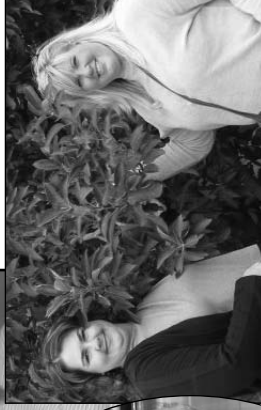
Apple picking at Eckerts

You are invited to join your ZTA alumnae sisters at the 1st meeting for 2009-2010